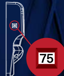
Field-configurable, for light and sound output