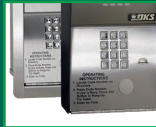
Flush or Surface mount available for 1802 & 1802-EPD, surface mount only for 1802-AP