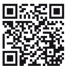
1802/1802 EDP 1802 AP

DoorKing®, Inc. Access Control Solutions since 1948 120 S. Glasgow Avenue, Inglewood, California 90301 U.S.A. Tel: 310-645-0023 FAX: 310-641-1586 www.doorking.com