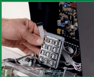
Modular Design makes installation and service easy