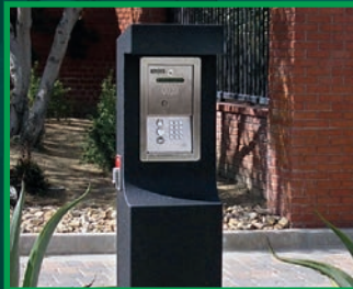
Mounting Kiosk available for flush mount models