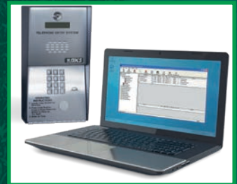
1802-AP PC Programmable free software download from doorking.com/software